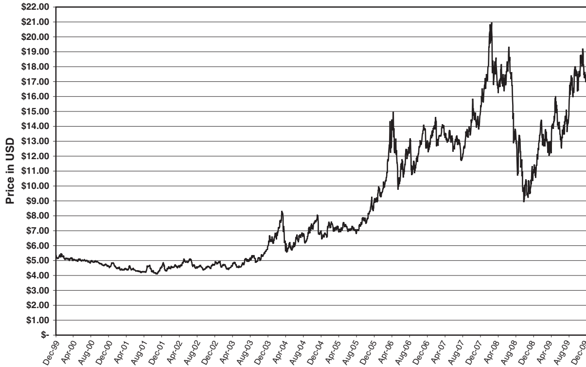
LBMA Silver Price (December 1999 - December 2009)

The following chart illustrates the changes in the London Fix silver prices from December 1999 through December 2009: